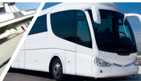
TRUCK AND BUS