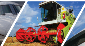
AGRICULTURAL AND OFF ROAD