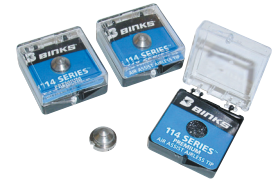
Premium fine finish and twist tip range available